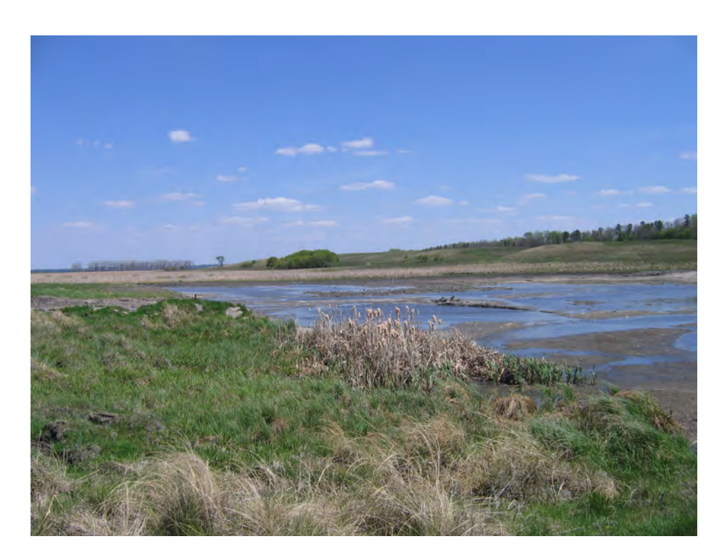
Figure 3. Eastern coulee excavation area.

Under such conditions several feet of erosion would be possible. Precipitation events of that magnitude are extremely rare, but have occurred periodically in the region.