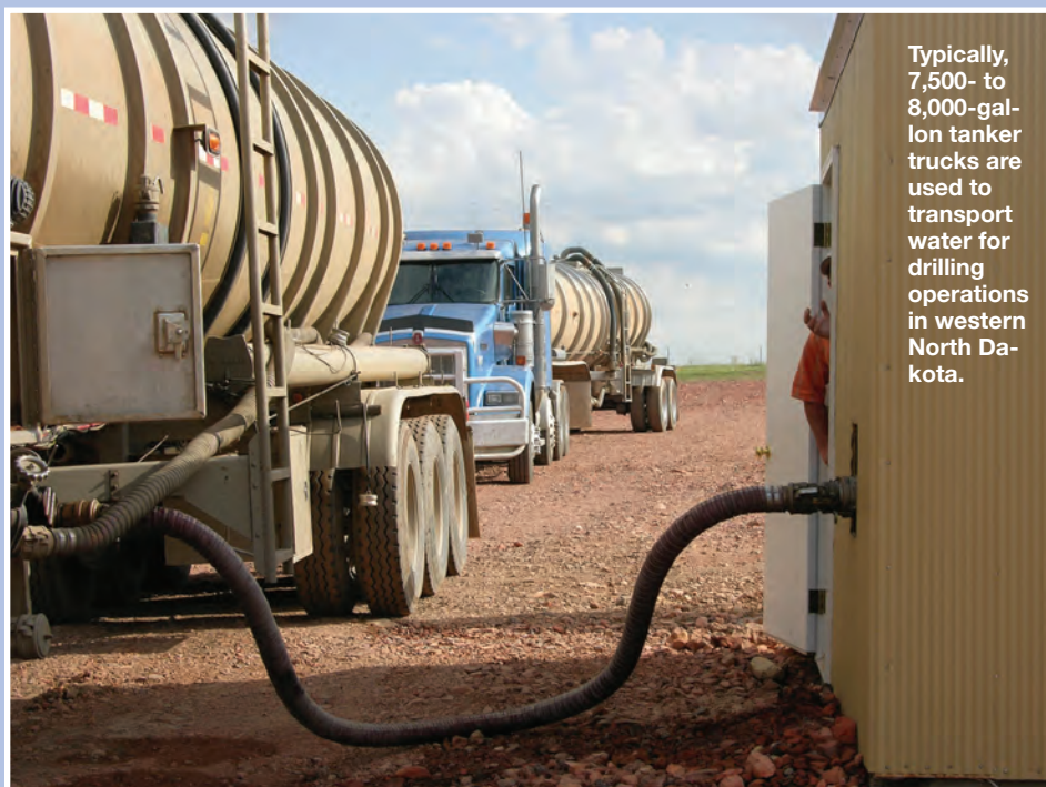
Typically, 7,500- to 8,000-gallon tanker trucks are used to transport water for drilling operations in western North Dakota.