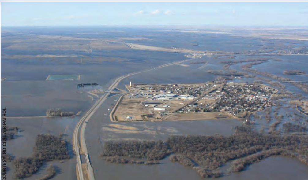
Pembina's levee and floodwall have been instrumental in protecting the city from flooding for years, as illustrated in this spring of 2009 photo.

The total cost of the analysis is estimated to be $91,000, of which $45,260 is eligible for a Water Commission grant. In response, the Commission approved a $27,156 grant for Pembina. Any future requests from Pembina to complete levee rehabilitation efforts (based on the analysis)