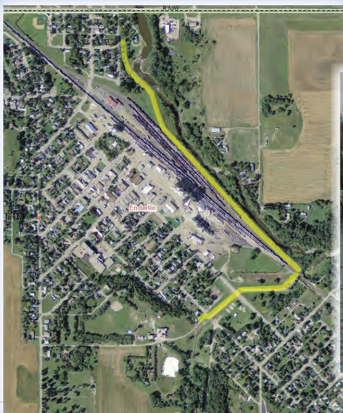
At left: The city of Enderlin and the location of their levee repair project. Below: Flooding along Highway 200 in Hazen (spring of 2009).

The roadbed of U.S. Highway 200, which runs through Hazen, was raised and constructed to form a