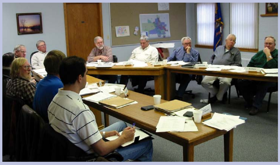
The Devils Lake Joint Board meets to discuss basin water issues in Devils Lake in 2006.