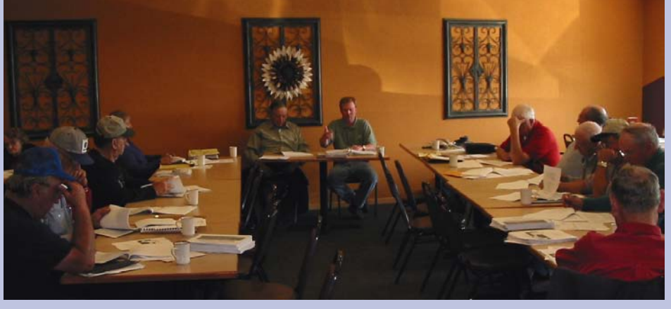
A meeting of the Upper Sheyenne Board in Carrington in 2005.

Recent work by the Upper Sheyenne Board has focused on exploring