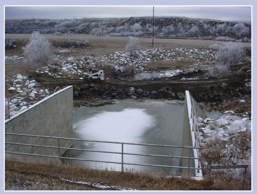
Earth-fill cofferdam downstream of the stilling basin at Sweetbriar Dam.

drain to drain; and construction of an earth-fill cofferdam downstream of the stilling basin to raise the tail-water and reduce the hydraulic gradient through the dam.