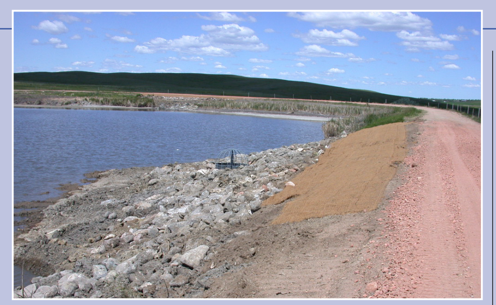
New 60-inch diameter CMP riser at Arnegard Dam.