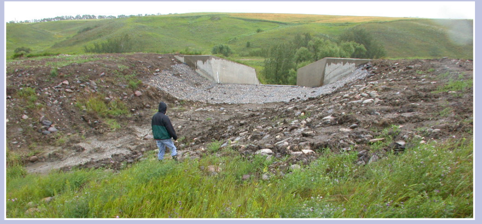
Inspection of reno mattresses filled with rock riprap at Armourdale Dam.