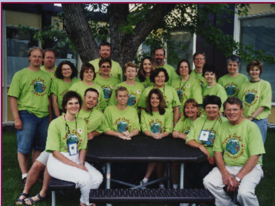
Devils Lake Workshop participants.