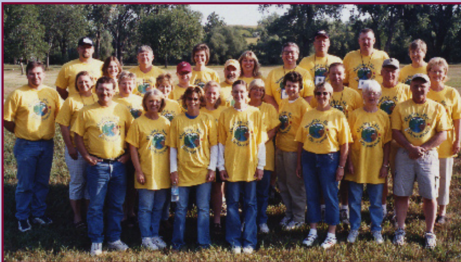
Missouri River Institute participants.

In addition, Missouri River Institute participants were able to observe a portion of Lake Sakakawea from pontoons donated by Captain Kits Marina of Pick City, North Dakota.