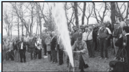
Governor Sinner opening the valve as Southwest Pipeline water reaches Dickinson in October 1991.

1986 - State Water Commission initiates a public information/education program in response to the need for quality information on North Dakota's water and related land resources.