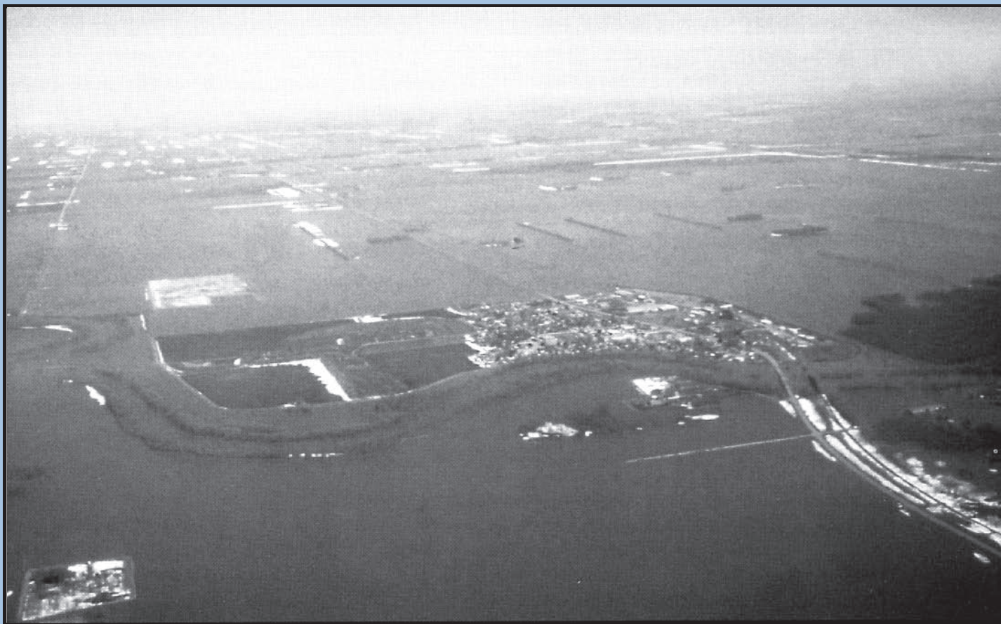
Flooding on the Red River north of Fargo, April 1997.

Project Impact was first started in the fall of 1997, and since its inception, there are now over 125 participating communities nationwide. Within North Dakota, Project Impact has been implemented in three communities thus far. The first North Dakota Project Impact community was Fargo, followed by Valley City, and most recently, Jamestown. These communities have always faced threats from natural disasters such as tornadoes, blizzards, and even wild fires, however, in recent years the most apparent threat has come from flood-related disasters. The flood of 1997 is undoubtedly the most vivid reminder, although, the city of Jamestown has been included in the